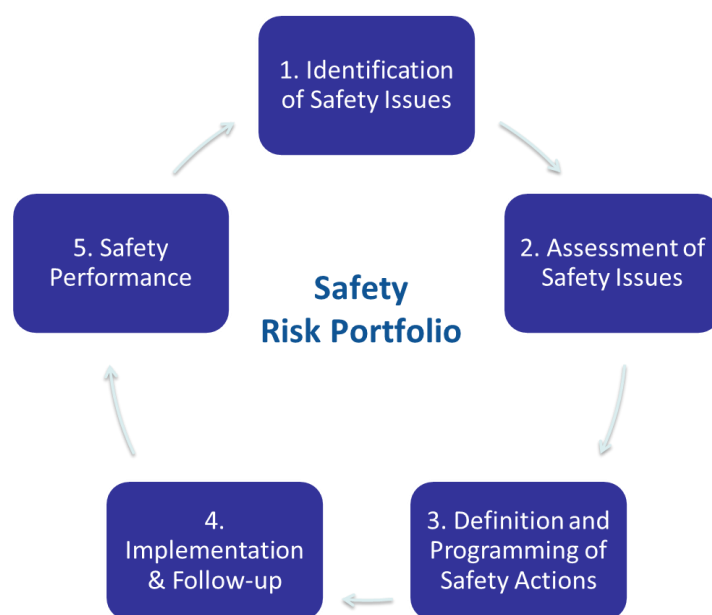
Diagram 4. Safety Risk Management process at EU level

This process consists of the following tasks described in the diagram below.