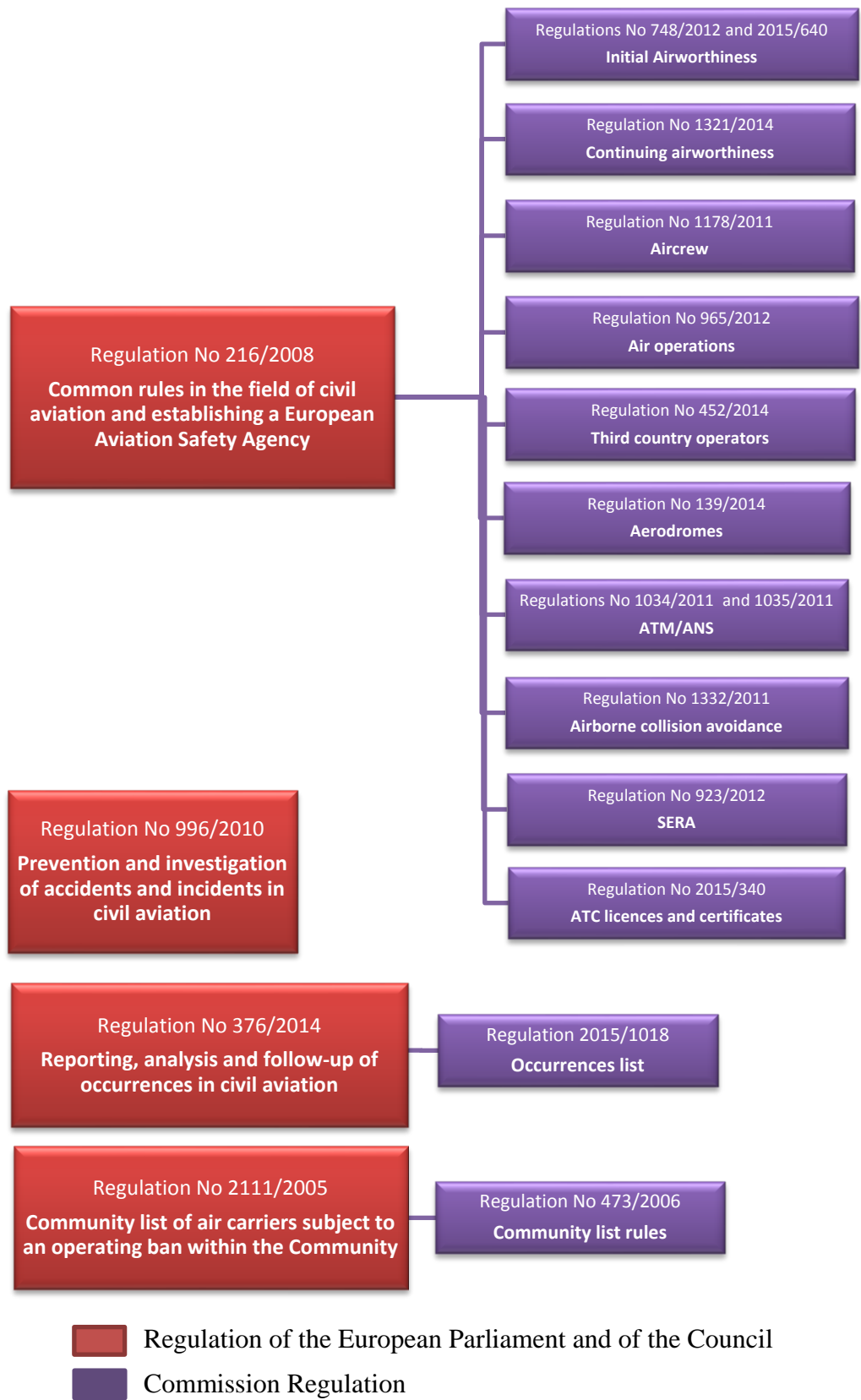
Diagram 1. Applicable European Union aviation safety legislation